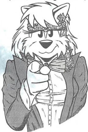
AS A MINICON VOLUNTEER